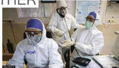
Department of Regulation and Prequalification, WHO